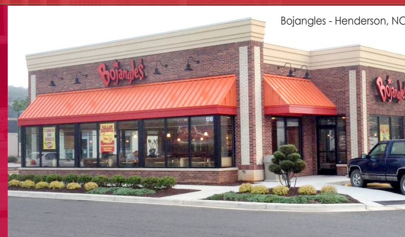
Bojangles - Henderson, NC

231 S. Garnett St. P.O. Box 108 Henderson, NC 27536 (252) 430-6161 www.rosemyr.com