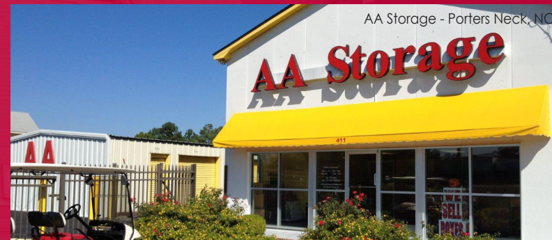
AA Storage - Porters Neck, NC

Locations of properties owned through real estate investment funds are not shown.