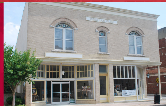
Corporate Office - Henderson, NC

231 S. Garnett St. P.O. Box 108 Henderson, NC 27536 (252) 430-6161 www.rosemyr.com